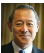
Ichiro Fujisaki Former Ambassador to the USA