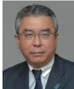
Shinsuke Sugiyama Former Ambassador to the USA; Former Vice Foreign Minister