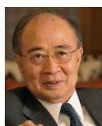
Yasushi Akashi Former Under-Secretary-General of the United Nations