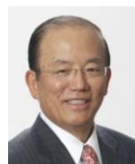
Toshiro Muto Former Deputy Governor, Bank of Japan