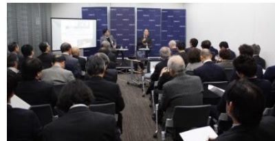
Member seminar with advisory board members