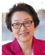
Yoriko Kawaguchi Former Minister of Foreign Affairs