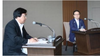
Forum with ministerial-level guest speakers

Premier members can participate in all general and members-only forums free of charge. They can also attend receptions held after many symposiums, where panelists are invited to speak with them. As supporters of our activities, general members can participate in a certain number of public discussion forums such as the "Genron Forum," which normally require a fee, for free.