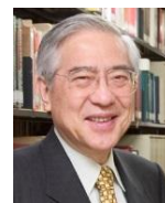
Kazuo Ogura Former Ambassador to the Republic of Korea