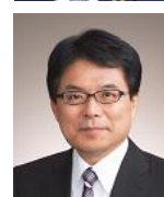
Hiroya Masuda Former Minister of Internal Affairs and Communications